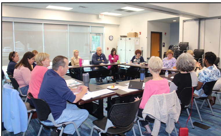
Participants at the first area non-profits workshop sponsored by ELCL share problems, ideas and opportunities to collaborate in a roundtable setting in the ELCL Community Room in January.

Other area nonprofits were identified with the hope they will choose to join the new consortium as the more participants, the greater the benefit to all.